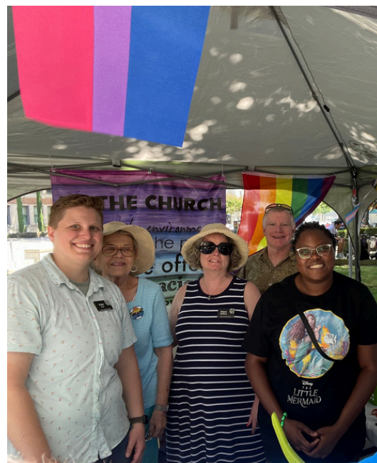
Faith Lutheran Church of Chino