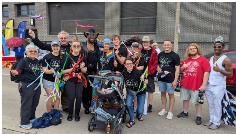
Lake Park Lutheran