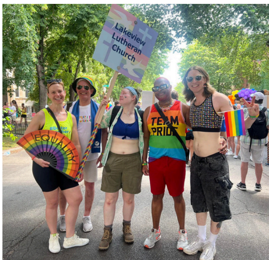
Lake View Lutheran

Showing support for LGBTQIA+ Lutherans is more important than ever. Thank you to our Reconciling in Christ partners who have share photos from their PRIDE celebrations and worship services. We are grateful to be in this holy ministry together.