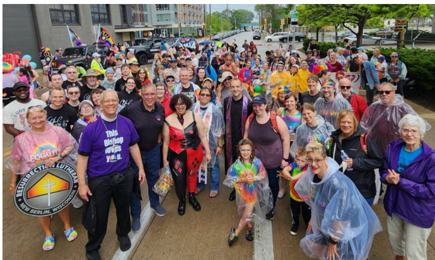
Greater Milwaukee Synod